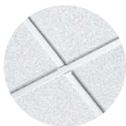
DUNE Second Look with PeakForm 24mm Exposed Grid