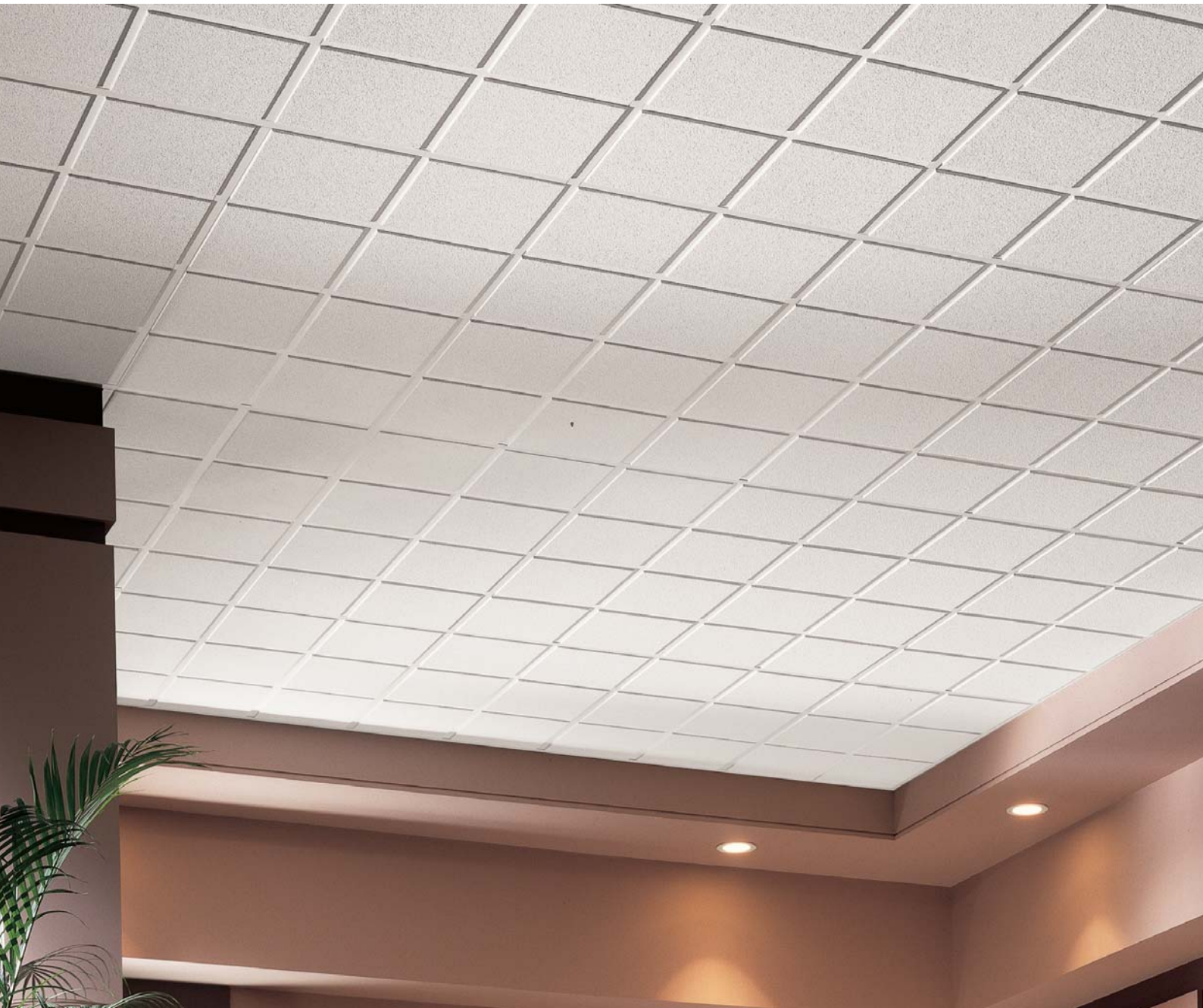
DUNE Second Look I with PEAKFORM 24mm Exposed Tee grid